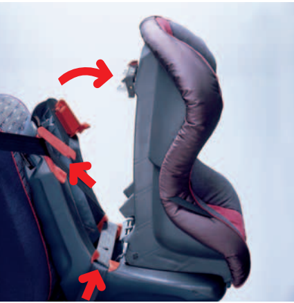
Fold the seat shell forward and insert the belt.

The unique belt tensoning system developed by RÖMER has been further improved upon in these two child seats („TS“ stands for Tensoning System). The design automatically tensions the car seat belt upon installation of the child seat to help achieve a secure installation without additional effort. The procedure is as easy as this: