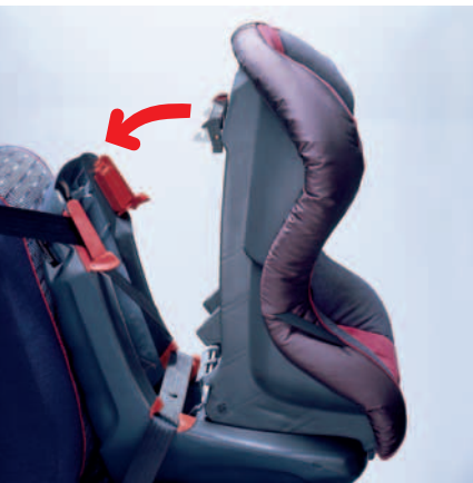
Fold the seat shell backward.