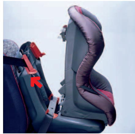
Close the belt clamp.